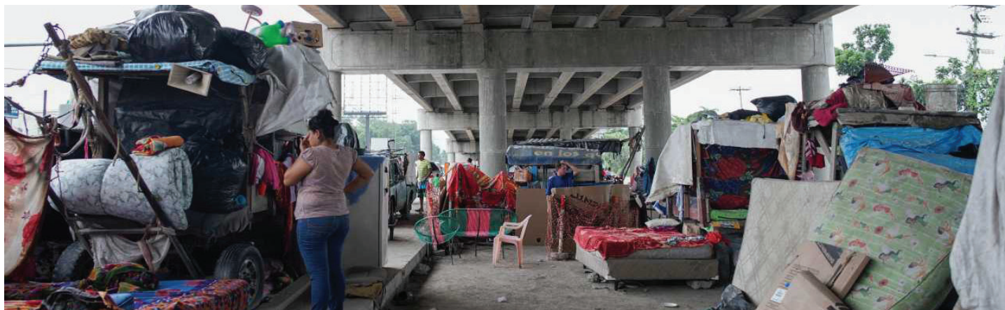
Cortés, Honduras | People awaiting to return to their homes in San Pedro Sula are taking shelter in exposed conditions, such as under a city bridge.