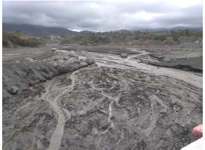
Photos: The Red Zone on the Windward side of St. Vincent & the Grenadines, from Georgetown to Owia. The CARICOM Operation Support Team (COST) visited the area on April 28.