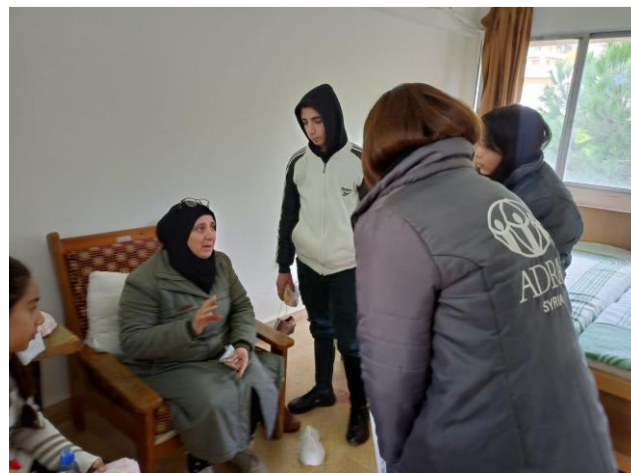
Beneficiary of ADRA's food distribution in Latakia.

"Thank you for your support, our house is damaged, and I don't have anyone to help except my two children because I lost my husband and my son 5 year ago."