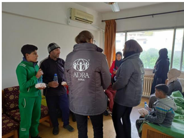
ADRA checking on families of the OOSC program in Latakia.

"I am very thankful for you being here to help us and check on us! Our house is partially damaged and could fall any second. I am happy to see you and I can't wait to attend the OOSC courses again."