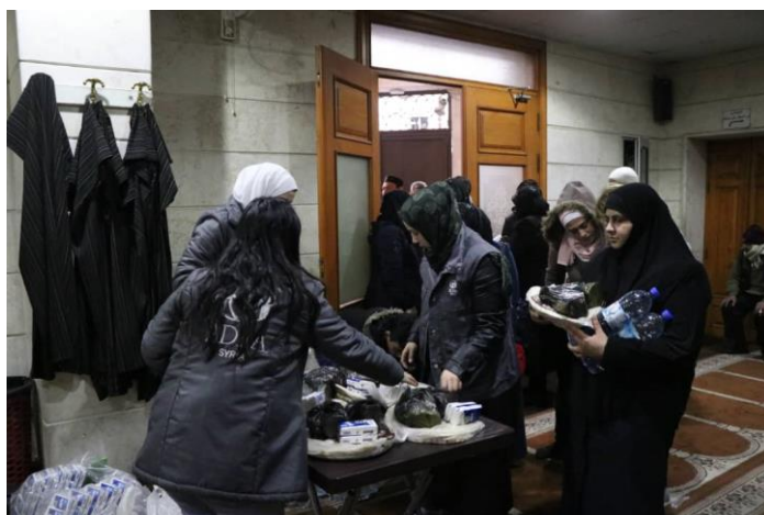
ADRA distributing food, water, and tissues in Al Bada Mosque, Aleppo