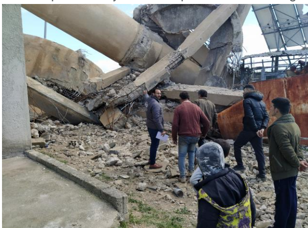
Above: Destroyed water tank in Aleppo;