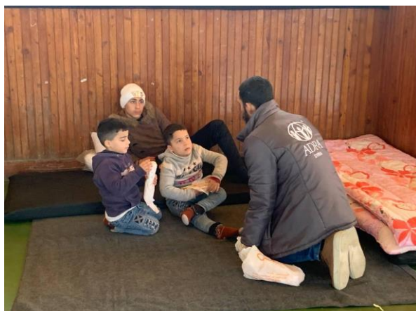
ADRA distributing food in Latakia.