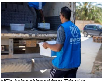
NFIs being shipped from Tripoli to Benghazi.

displaced people from Sudan, Syria and other nationalities who were not registered with UNHCR living in the affected areas. UNHCR is directly contacting registered refugees and asylum-seekers in those areas and reaching out through its website and social media accounts with basic information on available services.