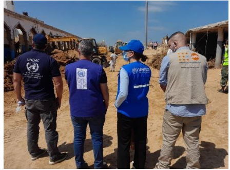
Interagency mission in Derna.

Between 9-11 September, Storm Daniel hit Libyan coastal cities, with severe weather conditions including unprecedented rainfall causing flooding, particularly in the eastern region. Around 4,000 deaths have been registered according to the World Health Organization, including 150 Sudanese who are believed to be refugees and asylum-seekers, while more than 9,000 are still missing in Derna alone. Over 40,000 people have been displaced across northeastern Libya according to IOM , though these figures are likely to be higher due to access challenges and limited data collection in the worst-affected areas, such as Derna, where at least 30,000 people have been displaced. Of around 50,000 refugees and asylum-seekers registered with UNHCR in Libya, more than 1,000 live in eastern Libya. However, UNHCR is aware of larger numbers of forcibly