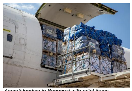
Aircraft landing in Benghazi with relief items.

IDPs in Derna, including blankets, hygiene kits, soaps, jerry cans, kitchen sets, tarpaulins through partner LibAid. Dispatching of NFIs is ongoing from Tripoli to Benghazi to increase capacity to respond. UNHCR is also dispatching medicines, rub halls, and power generators to affected locations. On 15 and 16 September, UNHCR participated in a joint interagency UN assessment mission to Derna, Soussa, Shahat and Al-Baydha, with the aim of assessing needs and preparing a response. The mission met with local officials and visited various sites including the field hospital in Derna. On 19 September, an aircraft carrying 53 metric tons of relief items arrived from the global stockpile in Dubai, with goods for 10,000 people. In addition, medicine for 10,000 people dispatched from Tripoli and arrived in Benghazi on 21 September.