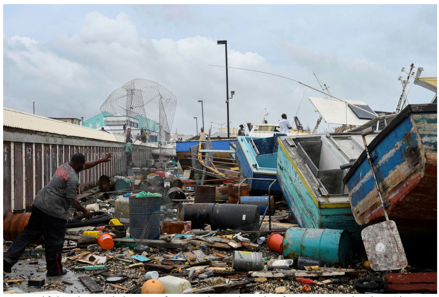
Damaged fishing boats piled on top of one another in the wake of Hurricane Beryl at the Bridgetown Fish Market in Bridgetown, Barbados, 1 July 2024.